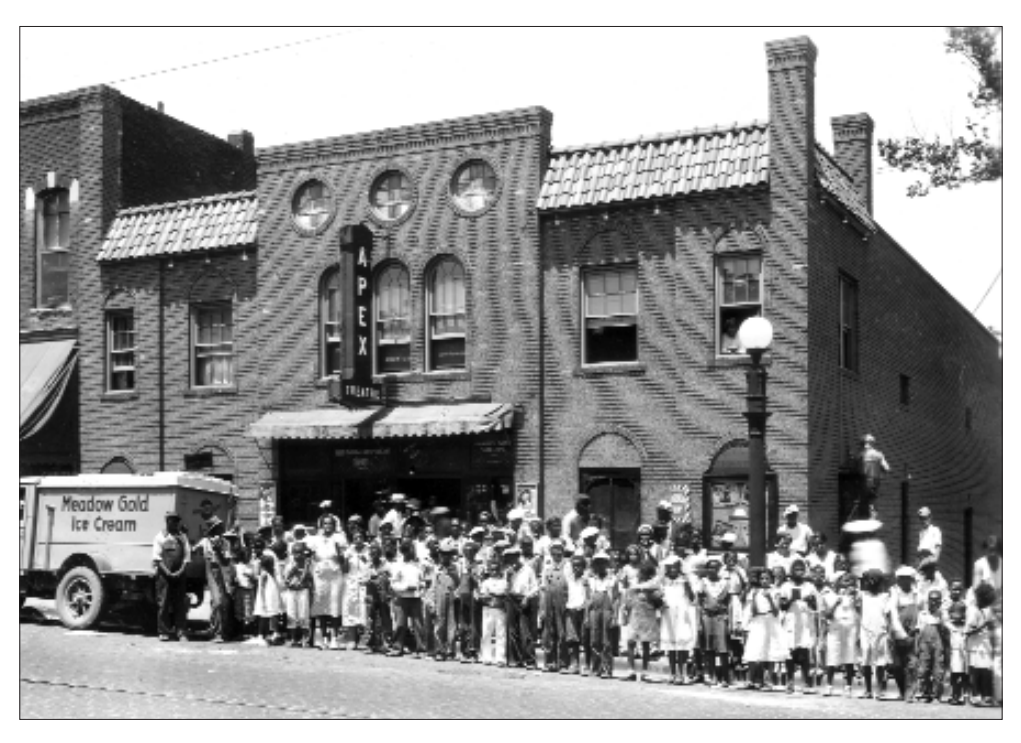
Topeka's black commercial district comprised various businesses including the Apex Theatre, photographed here with what appears to be a crowd of patrons in 1933.

African Americans could not use all of the city recreational facilities, but a good swimming pool and athletic fields were available to them in Central Park. As the plain-